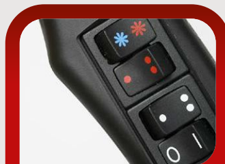
Temperature and speed switches + cold air button