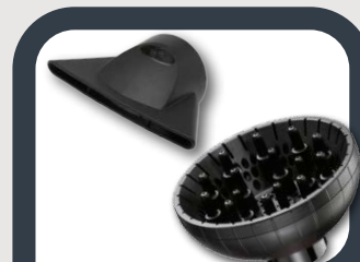
Optional nozzle OAS PLUS 90mm + diffuser